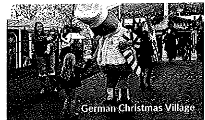
German Christmas Village

No holiday season is complete without the magnitude and sheer joy of the "Hallelujah" chorus. bsomusic.org